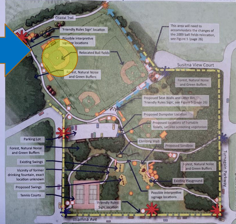
Figure 4: Master Plan Graphic - Proposed Future Conditions