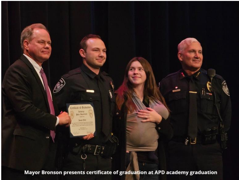
Mayor Bronson presents certificate of graduation at APD academy graduation