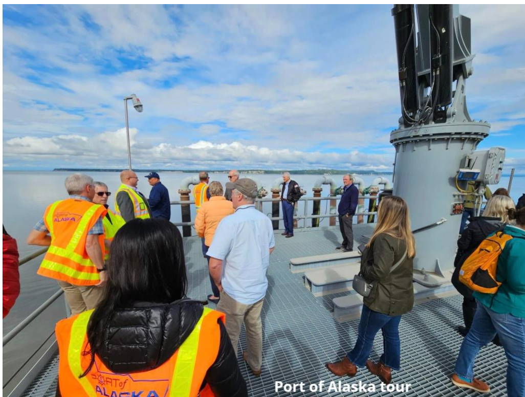
Port of Alaska tour

The Port of Alaska is our vital lifeline. It handles a staggering 75% of all inbound cargo for the entire state and supplies 90% of Alaskans with essential life sustaining commodities such as food and fuel. The significant investment and ongoing projects emphasize our commitment to fortifying the port's infrastructure and maintaining its critical role in supporting the well-being of our State.