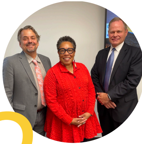
2 Increasing Housing Supply and Addressing Homelessness