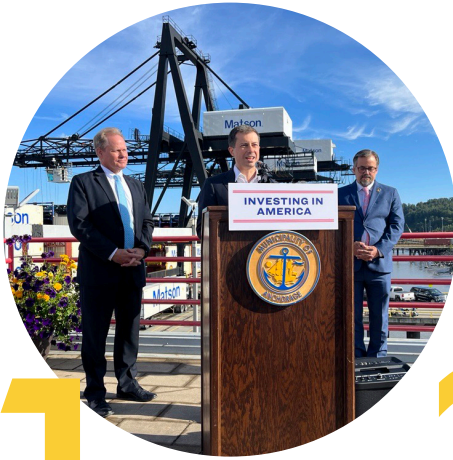
1 The Port of Alaska Modernization Project

The Municipality of Anchorage has three top priorities for the 2024 Legislative Session: