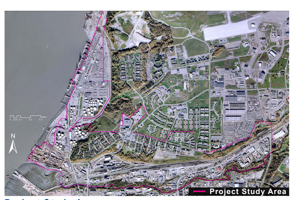
Project Study Area