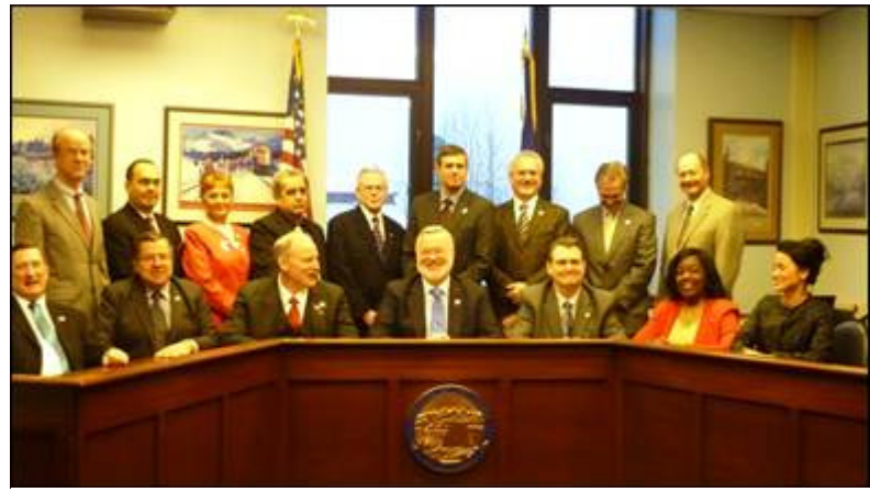
The Senate Bipartisan Working Group gathers in Juneau.

As a member of the <u>Bipartisan Working Group</u> made up of both Republicans and Democrats, I believe it is time to take a statesmanlike approach to savings—we should take billions off the table to avoid overspending. I am grateful my Senate colleagues share that opinion. In a recent work session, the Senate majority established several key priorities that we will release soon. Continuing our Savings Spree (savings before spending) will be chief among them.