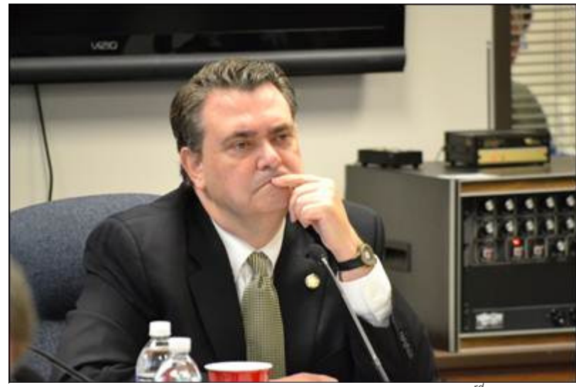
Senator Ellis chairing the Smart Justice Summit on October 3<sup>rd</sup>