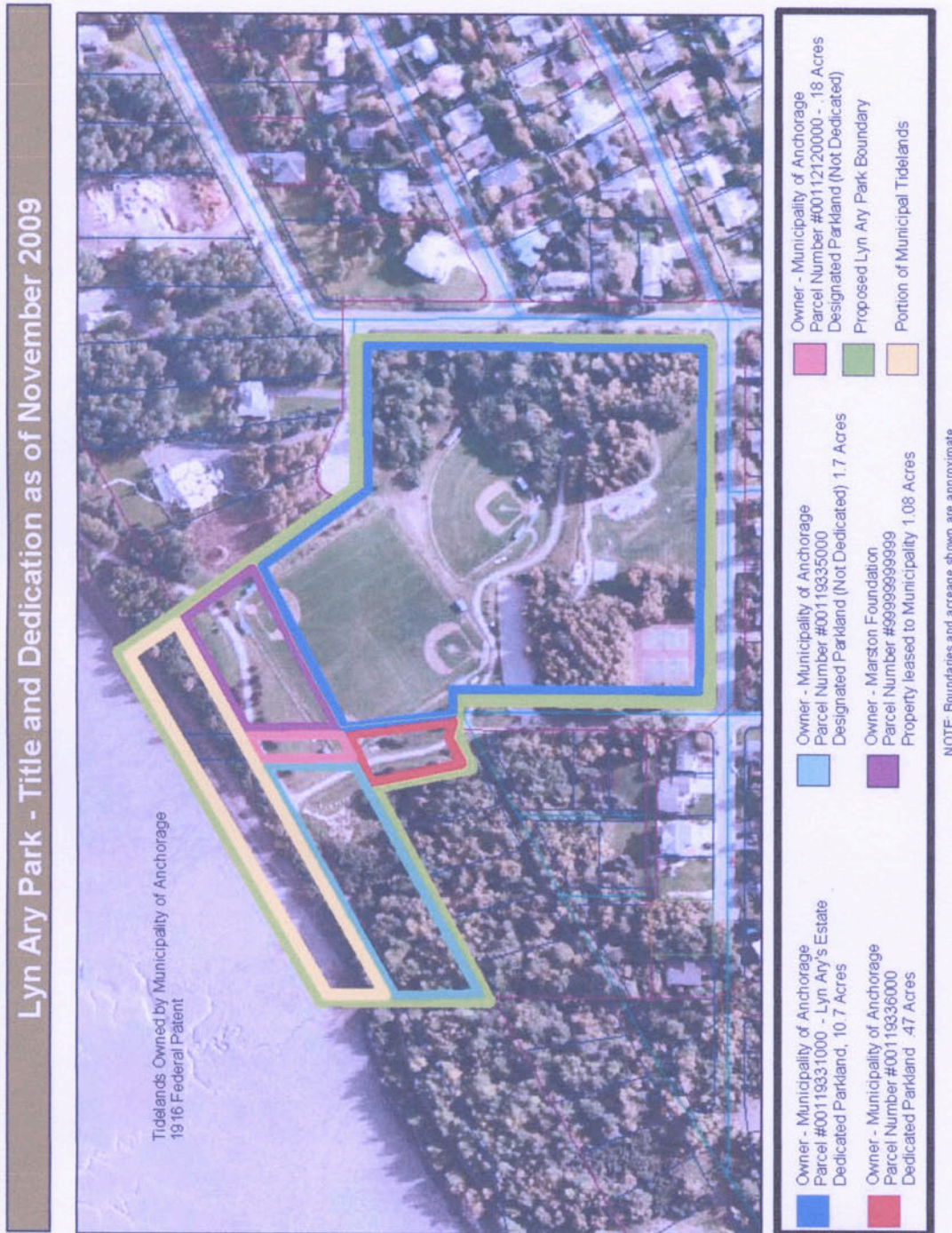
Figure 3: Title and Dedication Graphic