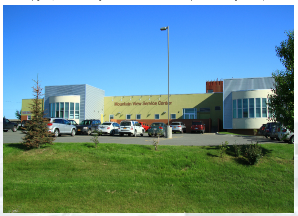
The Mountain View Service Center, formerly the Sadler Warehouse, which was bought and redeveloped by the Anchorage Community Land Trust in 2007 and currently houses eight nonprofit organizations.

The goals and action items in this section will be accomplished by a variety of organizations and resident-led groups. Policy changes will be enacted by the Anchorage Assembly; affordable housing developers that are already active in the neighborhood (such as the Cook Inlet Housing Authority, NeighborWorks Anchorage, and the Alaska Housing Finance Corporation) will strive to maintain and create more affordable housing. Affordable housing developers will continue to be long-term investors in the neighborhood. Along with the Mountain View Community Council, housing advocacy groups in Anchorage will work to interest for-profit housing developers, realtors, and potential buyers and renters in investing in Mountain